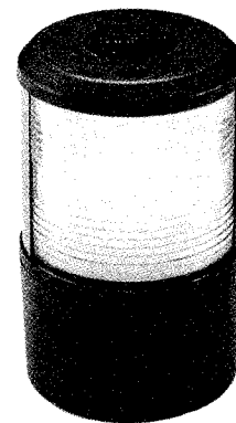
FIG. 200 TWB