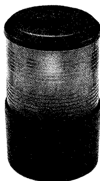
FIG. 200 SGB