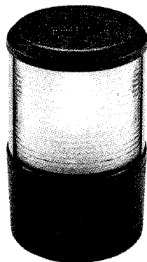
FIG. 200 SNB