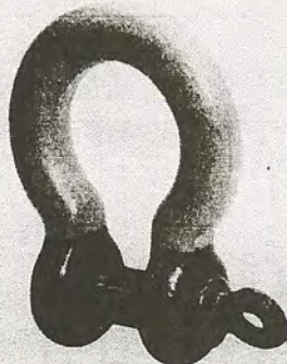
No. 263 Screwpin Shackle Eyed Pin