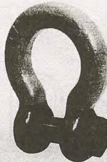
No. 264 Screwpin Shackle Hex Head Pin or Marine Hex Head