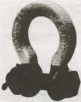
No. 320 Safety Pin Shackle