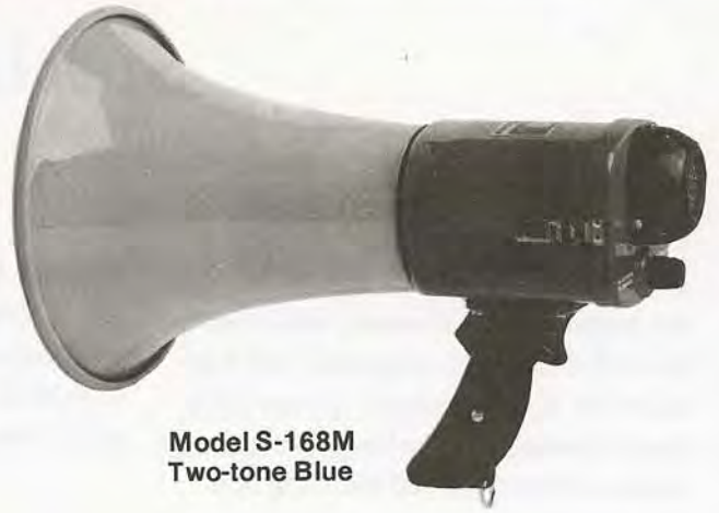
Model S-168M Two-tone Blue

Batteries, Naugahyde carrying case, adjustable shoulder strap, quick action mounting bracket optional.