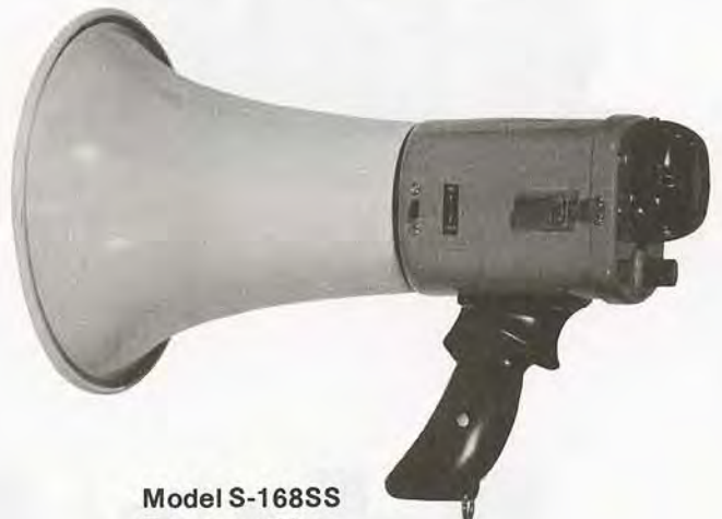
Model S-168SS Two-tone Blue