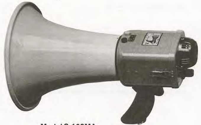
Model S-168MA Two-tone Blue

Also Available in International Orange or Solid Blue