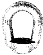
G-400 EYE NUTS