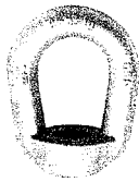
S-4028 BLANK EYE NUTS