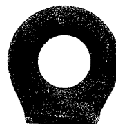
S-264 PAD EYES