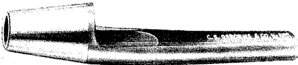
GROMMET HOLE CUTTER

Drop forged, tempered and polished edge. Inside tapered for easy clearance. Use with corresponding grommets and setting dies.